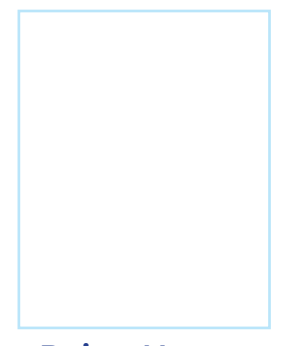
Paige Hoover Programming and Logistics Intern