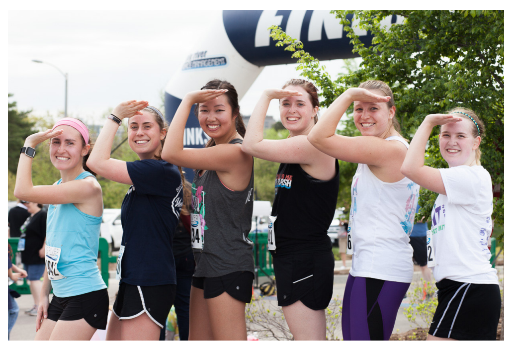
Delta Gamma participants at the Delta Gamma Center's 2018 Run for Sight

Services offered by the Delta Gamma Center include comprehensive early intervention services to address the needs of infants and toddlers who are blind or visually impaired and their families.