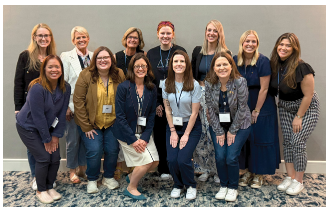
Top: Lewis Institute; Bottom: Dawson Institute